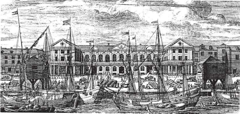
Fig. 2. The Custom House, 1668.

Rebuilt 'in a much more magnificent, uniform and commodious manner' as befitting the increased importance of London trade