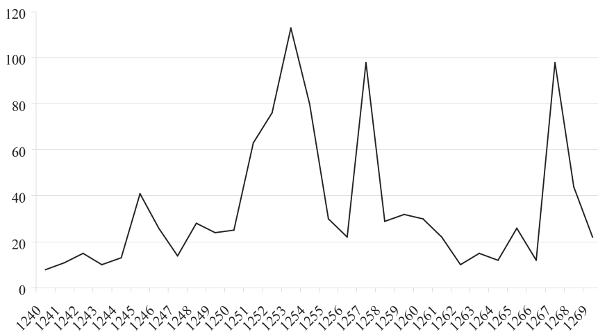
Fig. 2. Grants of markets and fairs between 1240 and 1269

the mid-thirteenth century (see Fig. 2). In the political climate of the royal court and political situation at that time – such as the expedition to Gascony, and the Baron’s War – the grant of markets and fairs became a significant patronage tool for Henry III and a source of income from the payment in gold from the recipients. An investigation of the unpublished Fine Rolls in The National Archives reveals that the number of payments fluctuated significantly in the 1250s. The results of this part of the project were presented by Dr Jamroziak at the Leeds Congress in July. Another paper on this subject will be given at the ‘Thirteenth Century Conference’ in Durham in the early September 2003. It will also result in the publication of two articles, one of them in the proceedings of the Durham conference.