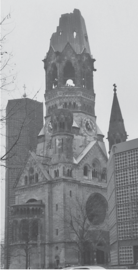
Fig. 5. Kaiser Wilhelm Memorial Church, Berlin

networks. In London, the most widely commemorated disaster is the Great Fire rather than the Blitz. St Paul's Cathedral, devastated in the Great Fire and rebuilt after 1666, was a symbol of national resistance during the Second World War. Despite (or perhaps because of) its wartime significance, the cathedral never became a focal point of war remembrance in London.